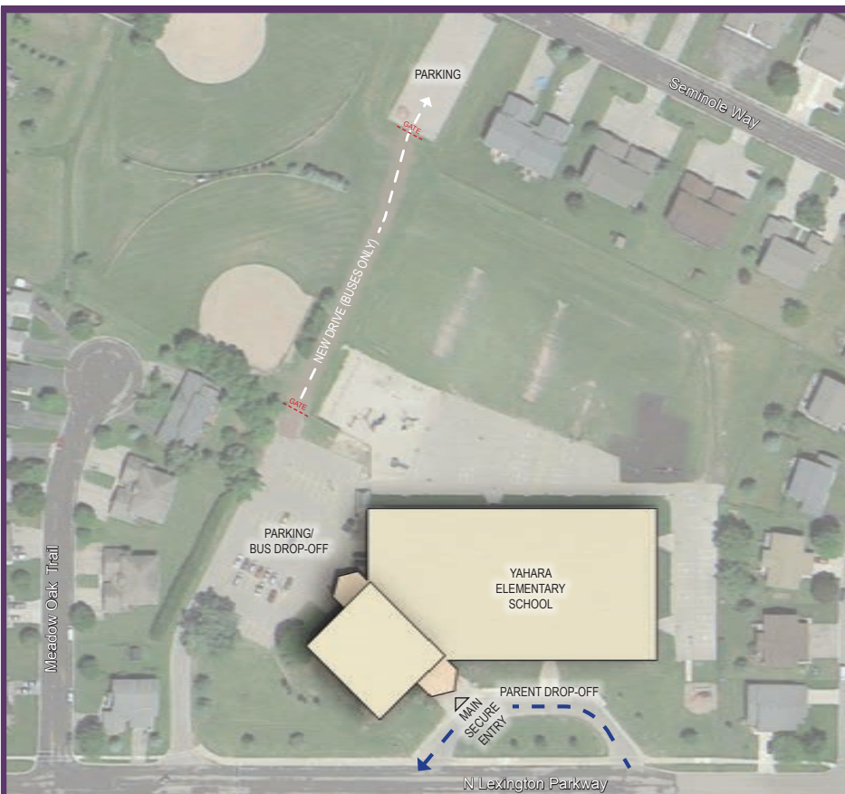
Yahara Elementary School