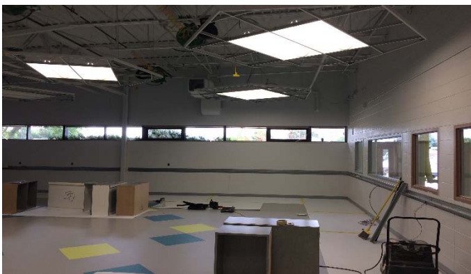
The STEM lab's flooring is complete as well as the ceiling "clouds". The countertops will be installed this coming week.