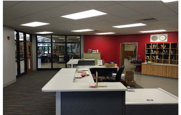
The completed office looking out into the commons area.