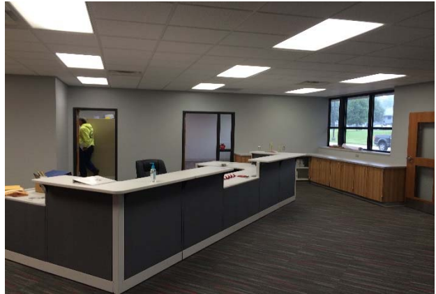
The view looking towards the principal's office and nurse's room.